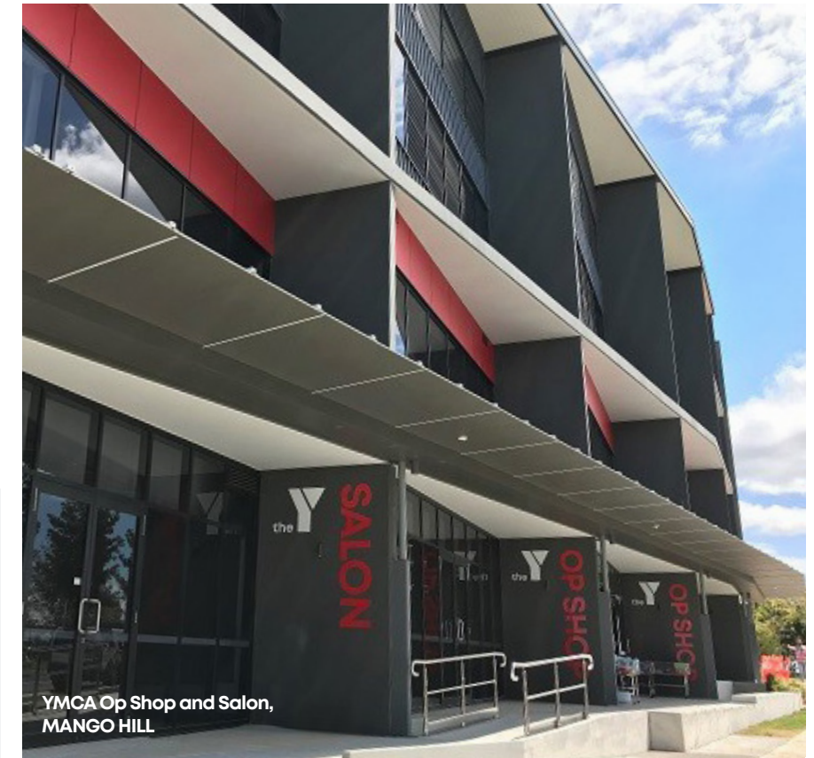
YMCA Op Shop and Salon, MANGO HILL

A second YMCA Op Shop has popped up with our Mango Hill store opening its doors on 29 August 2020. The op shop occupies part of the ground level of our multipurpose facility in Mango Hill, which is also home to a gymnastics centre, vocational school, community centre and salon.